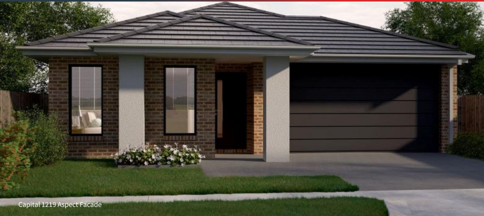
Capital 1219 Aspect Facade

LOT 517 BALLYCULLEN ROAD, ATTICUS, DONNYBROOK