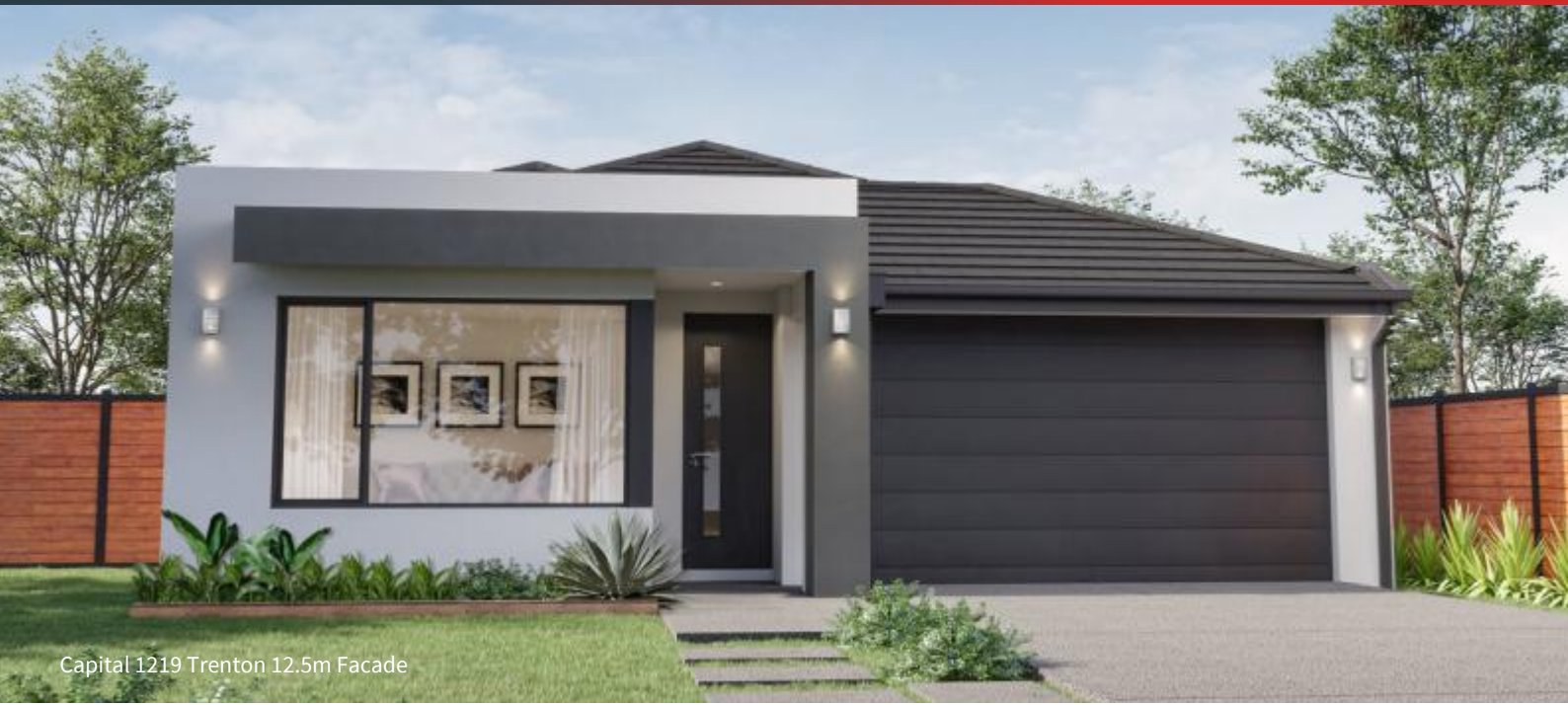
Capital 1219 Trenton 12.5m Facade

LOT 451 BRITTAS STREET , ATTICUS , WOODSTOCK HOME SIZE - 19sqm LAND SIZE - 405m 2